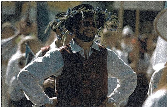
The quintennial Laulupidu festival this year featured 42,000 performers.

Suddenly a tiny country feels like a very big place.